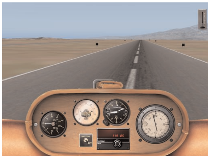
elegant and simple controls