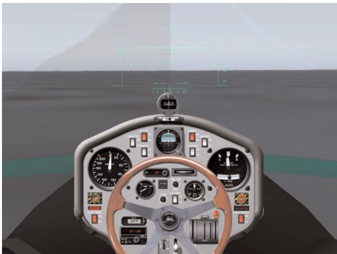
an animated steering wheel and sound effects enhance the sim boating experience