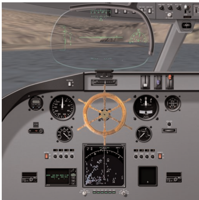
an animated steering wheel and sound effects enhance the sim hovercraft experience