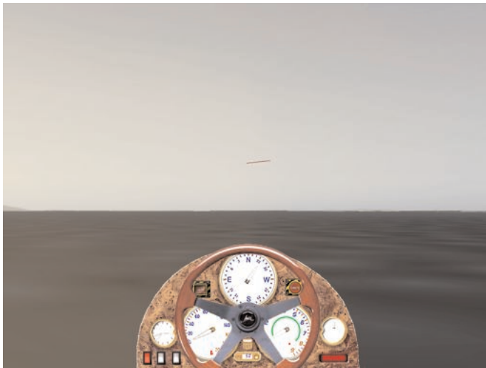
an animated steering wheel and sound effects enhance the sim boating experience